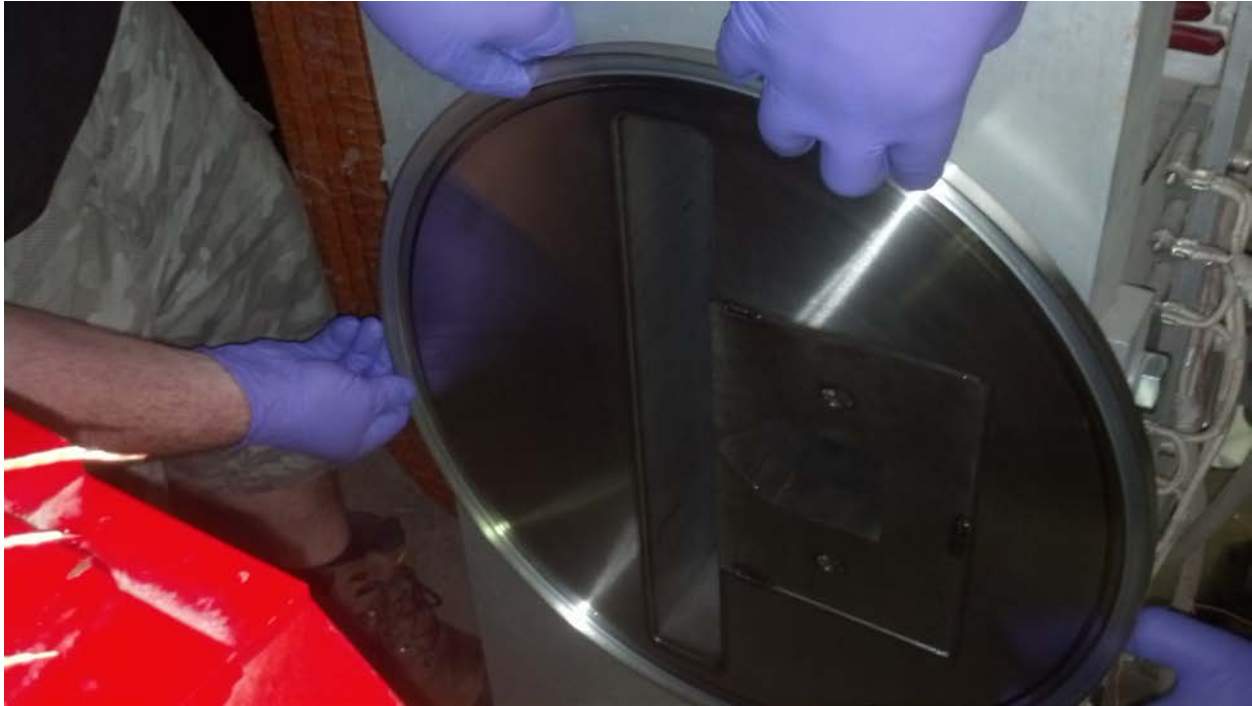
Photo 2: Installing Aluminum Knife Edge Seal under retaining ring and against magnet flange.