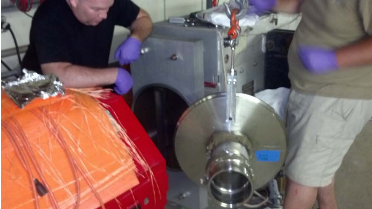
Photo 3: Installing the second EVAC Flange. Note use of lifting fixture and PALD.