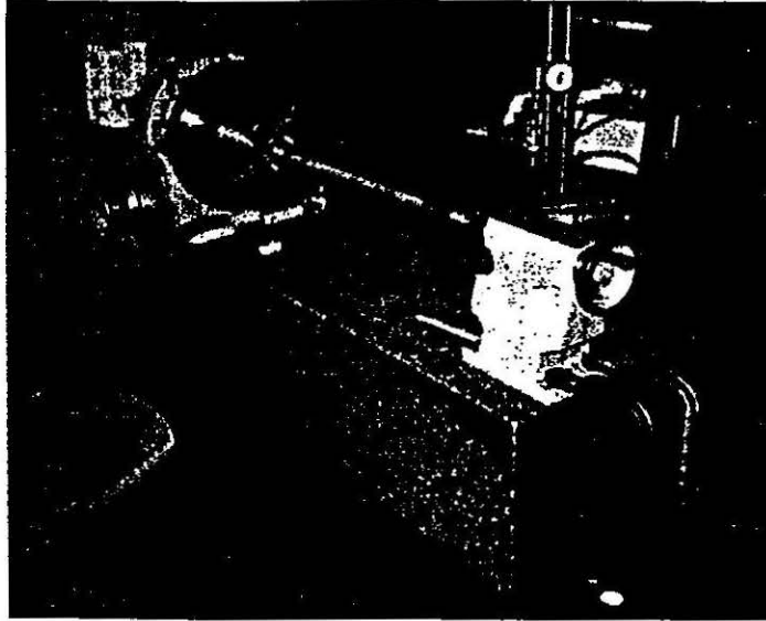
MORGAN COIL ROTATING PROBE SETUP.