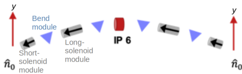
Figure 3: Spin rotator section of the EIC IR.

angles. The quadrupoles between the solenoids ensure transverse decoupling and horizontal spin matching. At 18 GeV only the long solenoids are turned on, whereas at 5 GeV only the short solenoids are turned on. Both are used at 10 GeV. The bending angle between the solenoid modules is set to 97.81 mrad and is achieved through the use of five 3.8-m dipoles. A bending angle of 38.79 mrad is required between the long-solenoid module and the IP.