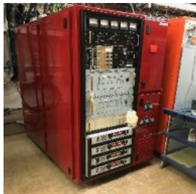
Figure 2: Main Injector Dual-Tube Modulator

In the Main Injector, the upgrades include an increase in RF power by installing a second power tube in each of the Main Injector RF stations. Each of the modulators will be upgraded to accommodate another tube and the solid-state drivers in each station will be upgraded with additional power to drive the additional tube. Tubes are being supplied by Communications and Power Industries (CPI) and are arriving ahead of schedule. The first prototype modulator has been upgraded and is operational, as pictured in Figure 2.