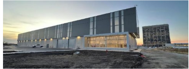
Figure 4: Cryogenic Plant Building

construction on the PIP-II site. The Booster Transfer Line is not scheduled to start construction until late Calendar Year 2025.