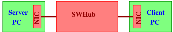
Figure 2: Setup for GbE performance evaluation.

Table 1 shows computer system (PC), Network Interface Card (NIC), and Switching Hub (SW) used for the performance evaluation. The operating system on PC is Linux OS , which supports many excellent DAQ drivers and data analyzing softwares. The setup for the GbE performance evaluation is shown in Figure 2. Three types of connection between Client/Server PCs are tested: (1) 3Com SW, (2) Alteon SW, and (3) direct connection. Alteon NIC and SW support large Maximum Transmission Unit (MTU), so that the performance with large MTU was also measured. The software for the performance evaluation is Netperf .