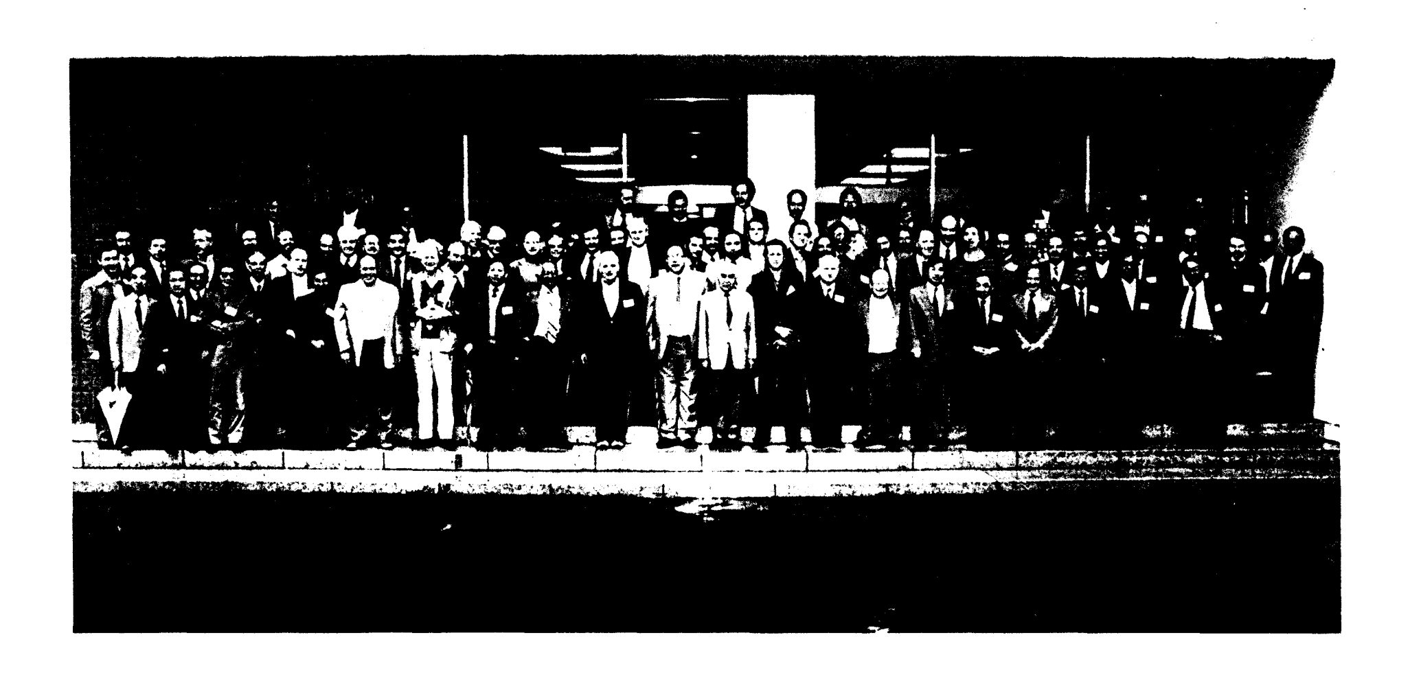
In front of the Main building of KEK - A Relaxing rainy day