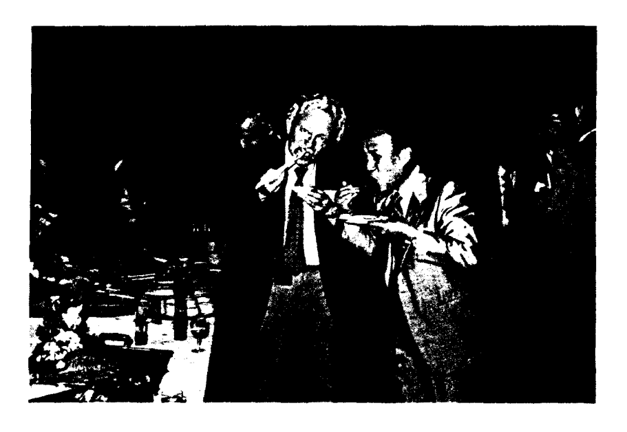
Reception - Enjoying Japanese foods