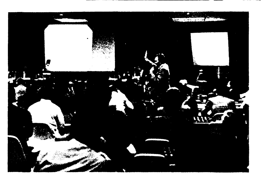
In the Exciting sessions