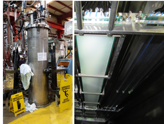
Figure 3: (Left) The TallBo test stand with hodoscopes on either side. (Right) Prototypes from the recent test. The prototype with plates and a light guide is to the left and the dipped prototypes are to the right.

Further testing in the LAr facilities at Fermilab will continue to provide feedback on the performance of prototype PD system designs and can explore other potential PD systems which fit in a similar framework. In addition to the testing described above, PD prototypes were deployed behind wire planes in the 35-ton prototype test at Fermilab, providing system-wide operational experience. Additionally, PD system prototypes will be deployed in the protoDUNE single-phase test program at CERN, where they will be tested side-by-side along with prototype TPCs.