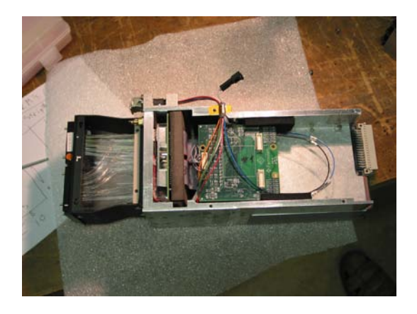
Figure 2: A prototype EODU that was used in a beam test in 2011.

one possible layering scenario for HCAL. The colors indicate the depths for the HCAL towers; in this design, HB has 3 depth segmentations, with interleaved layers for the rear compartment that go to 2 SiPMs that are electrically summed together into a single readout channel. This design adds redundancy in case of an SiPM failure, reduces the required dynamic range of the SiPM, and requires only 3 times the number of front-end channels. Schedule and fiscal constraints limit the upgrade design to reusing much of the existing infrastructure (readout boxes (RBX), digital data fibers, water cooling pipes). Space and electronics cooling constraints restrict the increase in channel count to no more than 3 or 4 times the current number. Current readout boxes dissipate roughly 100W of power. The power budget goal for the upgraded electronics is ~200W. The higher power chips (e.g. FPGAs and transmitter chips) will be put on boards that will have better thermal coupling to the existing RBX cooling plate.